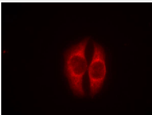
Immunofluorescence staining of methanol-fixed HeLa cells using p53(Phospho-Ser37) Antibody #11098.