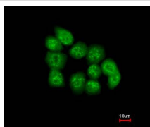
Costained with Hoechst 33342