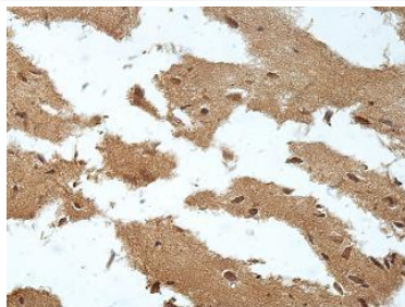
Immunohistochemical staining of formalin-fixed paraffin-embedded fetal brain showing nucleus staining with anti-WDSOF1 antibody at a dilution of 1/100