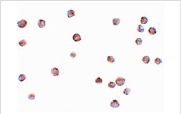
Immunocytochemistry of LYRM2 in A549 cells with LYRM2 antibody at 20 ug/mL.