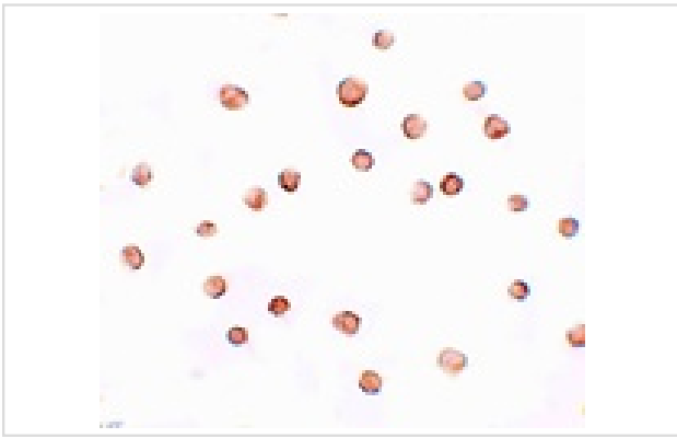
Immunocytochemistry of TCC52 in 293 cells with TCC52 antibody at 2.5 ug/mL.