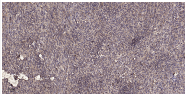
Immunohistochemical analysis of paraffin-embedded human Colon cancer.

Note: This product is for in vitro research use only