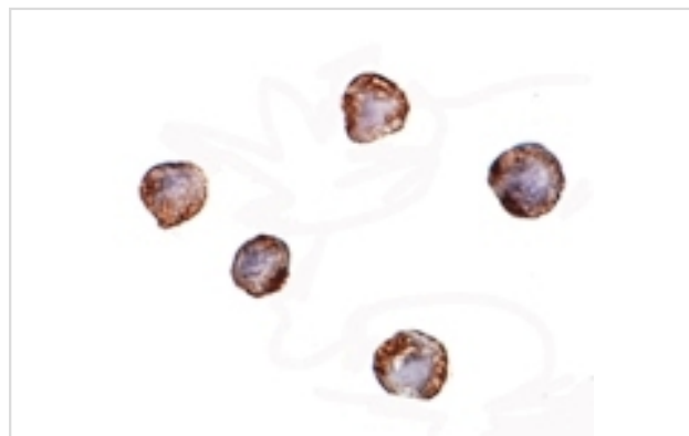
Immunocytochemistry of XBP-1 in HepG2 cells with XBP-1 antibody at 2 ug/mL.